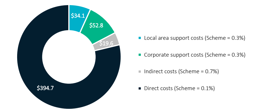
Figure 2: Total Sunwater cost pools and allocation to scheme—2022/23 forecast ($M)