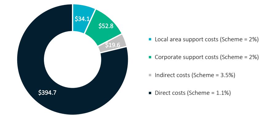
Figure 2: Total Sunwater cost pools and allocation to scheme—2022/23 forecast ($M)