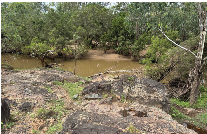
Right bank at the proposed Cooranga Weir site

Delivering this project is a key commitment of the Queensland Government and Sunwater is working to progress planning and environmental approvals required for the construction of the new weir.