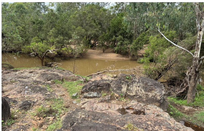
Right bank at the proposed Cooranga Weir site

Delivering this project is a key commitment of the Queensland Government and Sunwater is working to progress planning and environmental approvals required for the construction of the new weir.