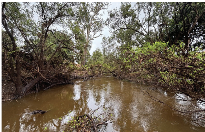
Proposed Barlil Weir site near Murgon

Delivering this project is a key commitment of the Queensland Government and Sunwater is working to progress planning and environmental approvals required for the construction of the new weir.