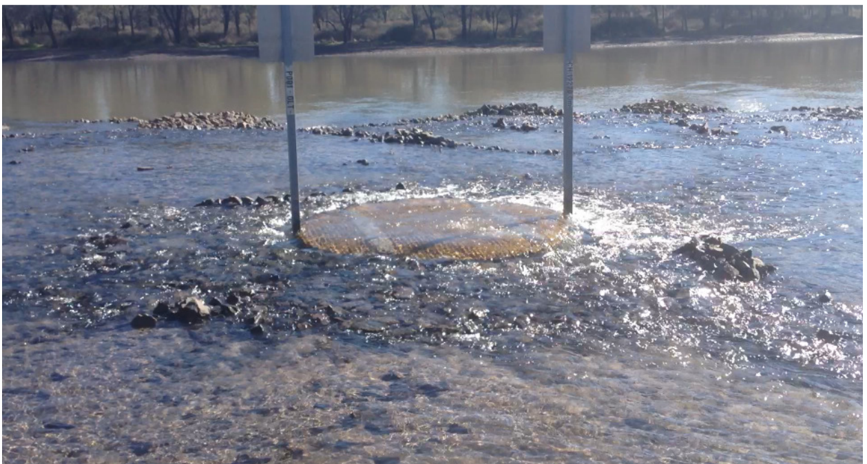
Figure 2: Kenya to Chinchilla Weir pipeline outfall location

The water is distributed to customers in a manner that ensures it does not pass beyond the boundaries of the scheme. This ensures that the Chinchilla Beneficial Use Scheme is operated in a way that preserves and protects the existing cultural and economic values of the receiving environment. The majority of CSG water customers extract water from the Chinchilla Weir. Discharge to the Chinchilla Weir is via the approved discharge point under the RWMP, while monitoring occurs at both the WTP outlet (at the Treated Water Pump Station) and prior to discharge into the Weir.