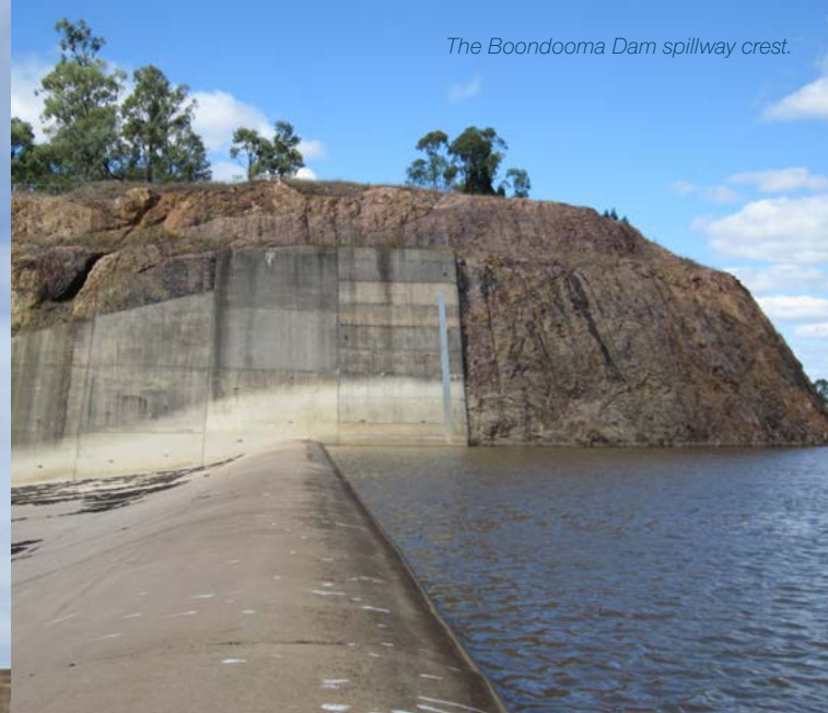
The Boondooma Dam spillway crest.